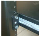
Figure 1b: Rack installation