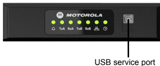
Figure 4: Front panel

The SLR 5000 Series Repeater connector to facilitate the CPS configuration is a USB Type-B host connection located on the front of the repeater. See Figure 4.