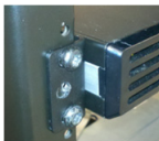
Figure 2a: Mounting hardware Figure 2b: Mounting hardware