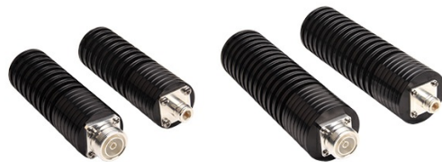
PRL 50W-7/16 + PRL 50W-N