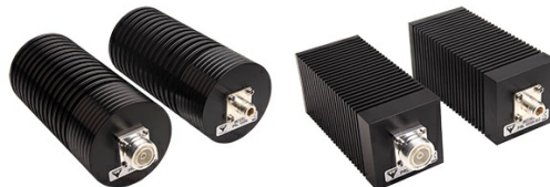
PRL 100W-7/16 DIN + PRL 100W-N